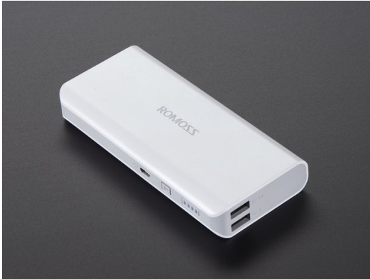
USB Battery Pack for Raspberry Pi - 10000mAh - 2 x 5V outputs