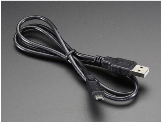
USB cable - USB A to Micro-B