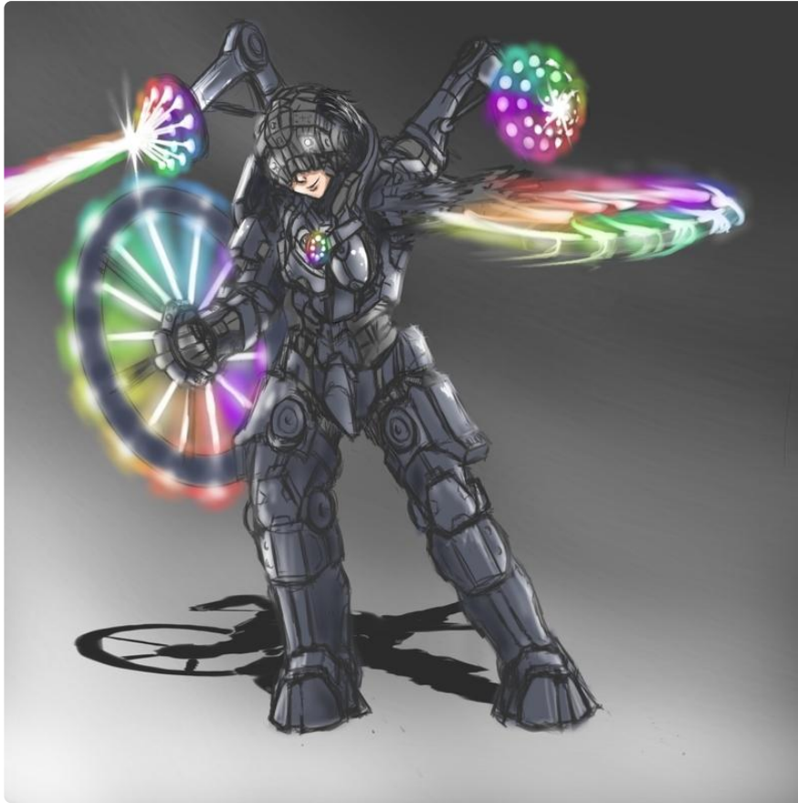
Illustration by David Earl

Digital RGB LEDs like the Neopixel are awesome for creating stunning displays and lighting effects. But integrating them into an interactive project can be a challenge. The Arduino is a single-minded little processor that only likes to do one thing at a time. So how do you get it to pay attention to external inputs while generating all those mesmerizing pixel patterns?