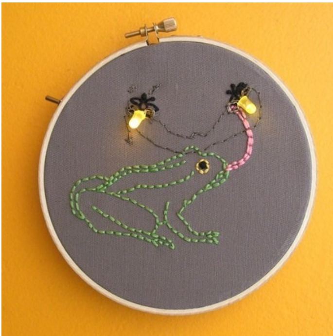
LED Embroidery ( https://adafru.it/c2C )