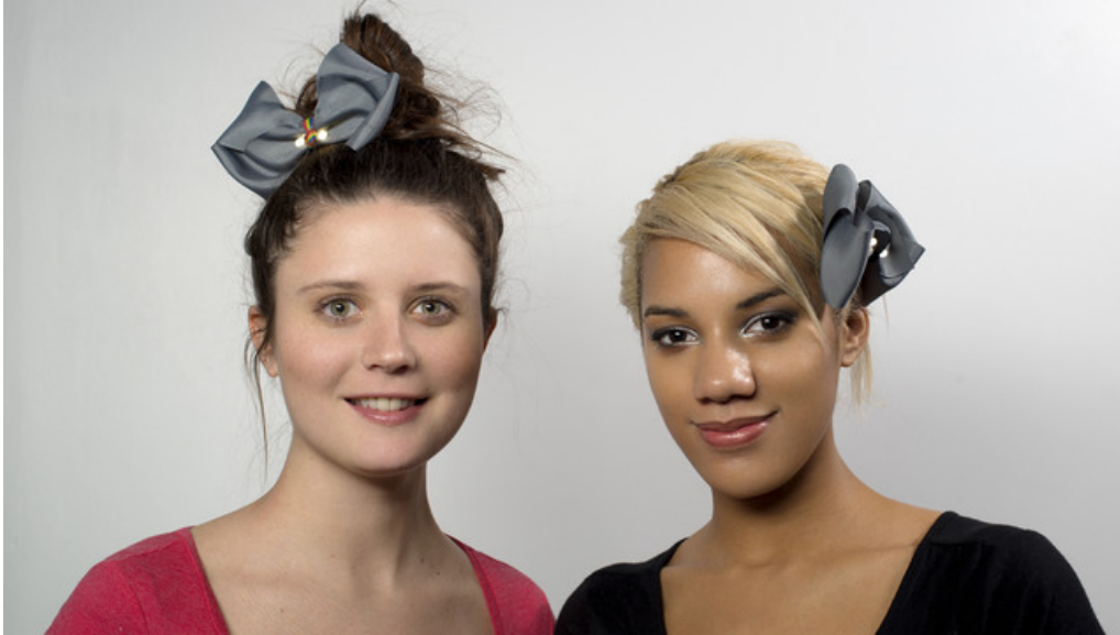
Candle Flicker Hair Bow ( https://adafru.it/c2B )