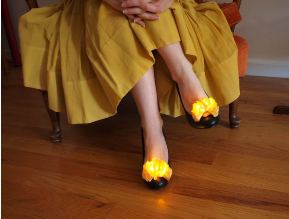
LED Shoe Clips ( https://adafru.it/c2D )