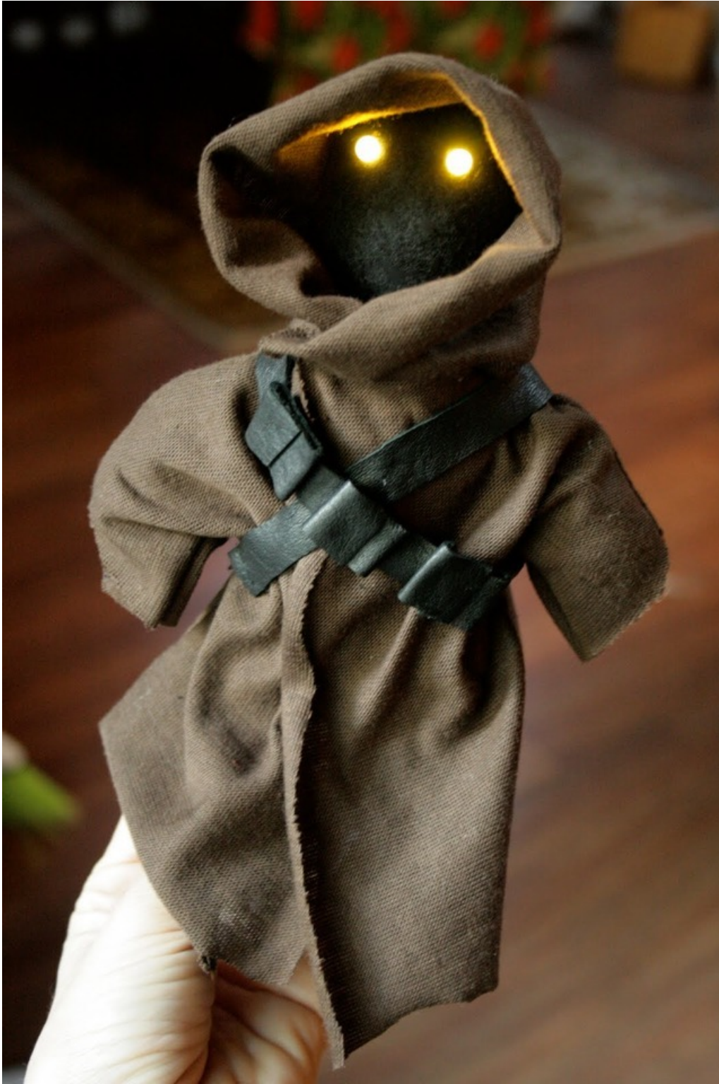
Jawa Dolls ( https://adafru.it/c2E )