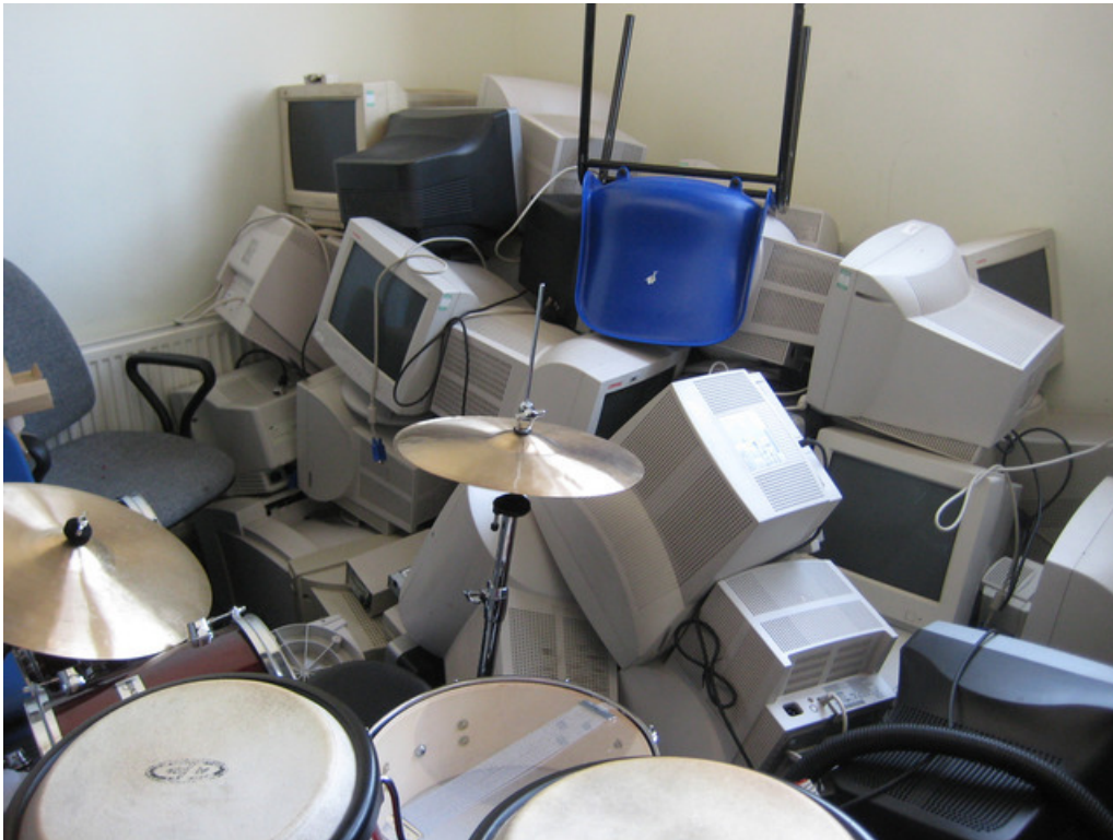
Potential pile of donations.

Some Hackerspaces accept large donations from individuals or companies in exchange for agreed-upon terms or product placement. This can be enormously helpful. But if you agree to do this, just make sure that the terms are in line with the values of your Hackerspace and its members, and that it won't impact the reputation of your Hackerspace in a way you don't intend.