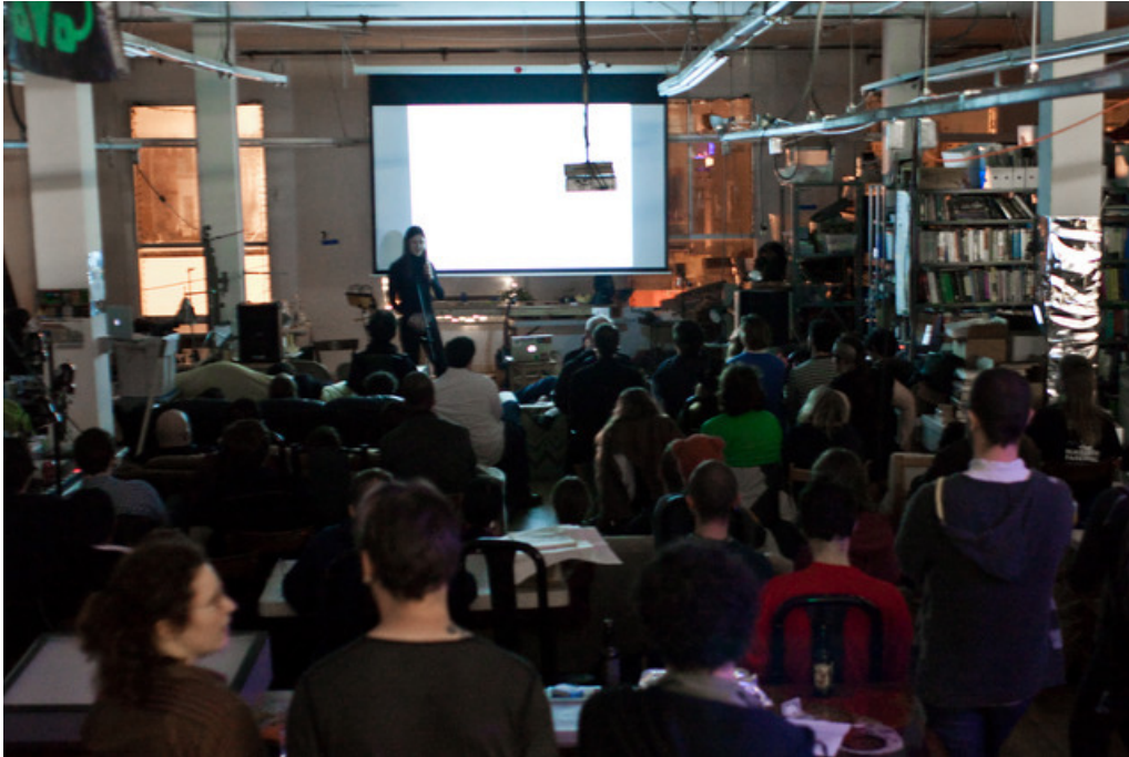
Five Minutes of Fame at Noisebridge (https://adafru.it/aXk)

Don't forget to check in with your membership about the dates, or refer to your calendar system.