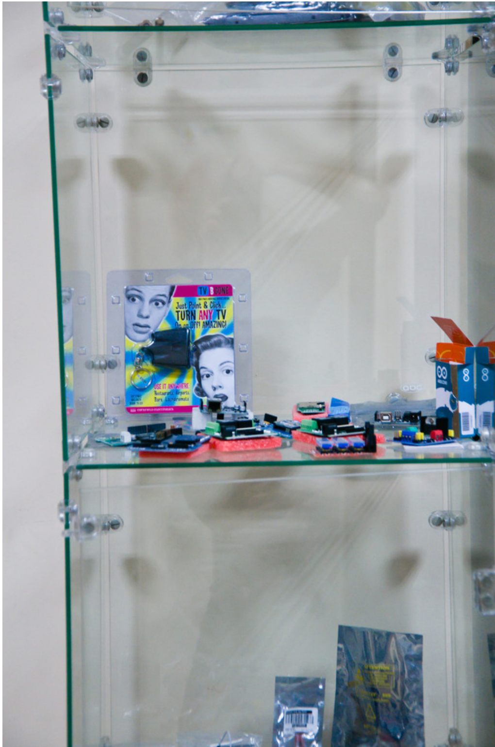
Kits for sale at Cairo Hackerspace (https://adafru.it/aXj) in Egypt.