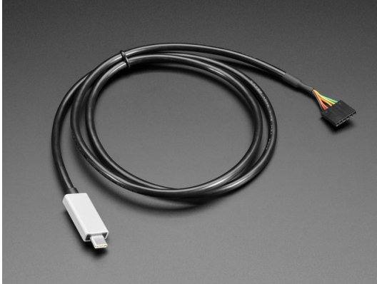
FTDI Serial TTL-232 USB Type C Cable