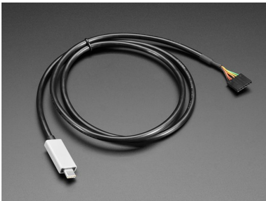
FTDI Serial TTL-232 USB Type C Cable