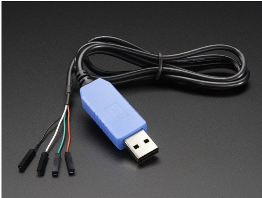
USB to TTL Serial Cable - Debug / Console Cable for Raspberry Pi

If you want to connect with a USB to TTL serial cable, we offer a few different cables, but either of these should cover most of your needs.